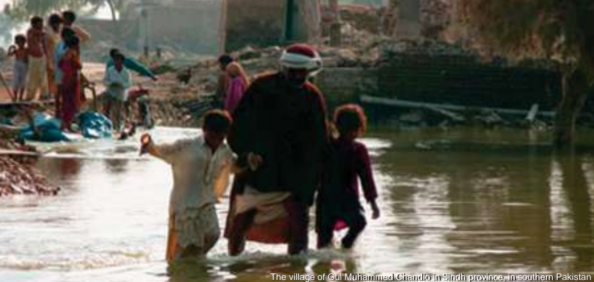
The village of Gul Muhammed Chandio in Sindh province, in southern Pakistan