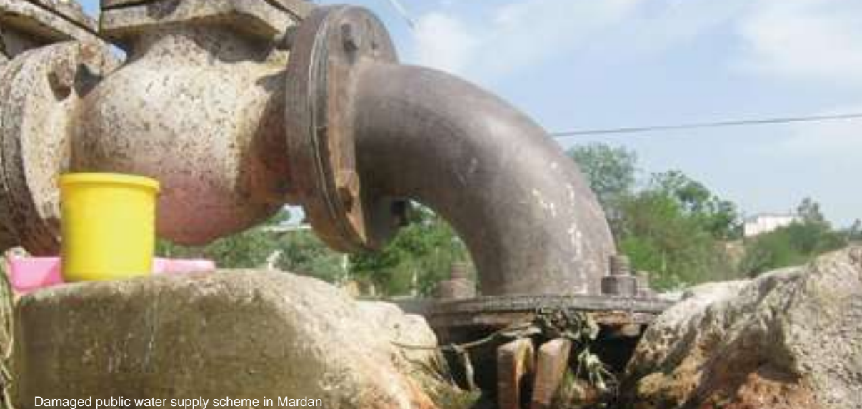
Damaged public water supply scheme in Mardan