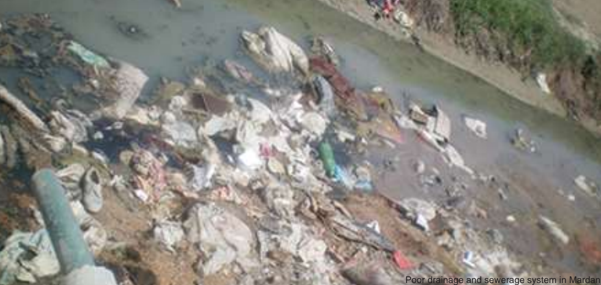
Poor drainage and sewerage system in Mardan